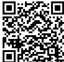
Children and Families