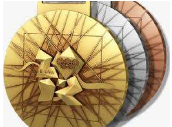
Medals from the London 2012 Olympics (UK).