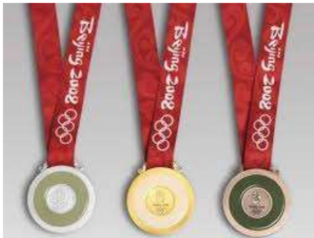
Medals from the Beijing 2008 Olympics (China).