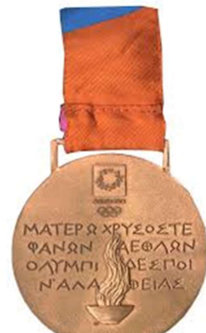
A bronze medal from the Athens 2004 Olympics (Greece).