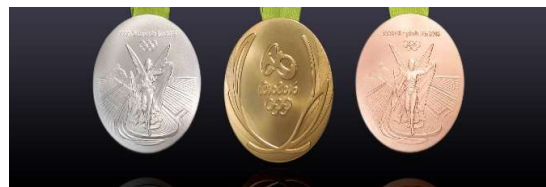
Medals from the 2016 Olympic Games.

Olympic medals are awarded to athletes who come 1 st , 2 nd or 3 rd in their event. Gold is awarded to the winner who comes 1 st , silver is awarded to 2 nd place and bronze to 3 rd place.