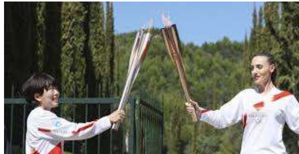
An image of the Olympic torch relay.

In the Ancient Greek Games a torch was lit outside the Temple of Hera using flames created from rays from the sun. Messengers took the torch around the country so that people knew about the games. Today the torch is lit as it was during the Ancient Olympic Games. The flame travels around Greece and then to the country where the games will be taking place.