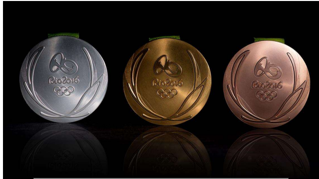
Medals from the Rio 2016 Olympics (Brazil).

Please design your own medal for the ceremony and write an explanation of what you have included on the medal and why.